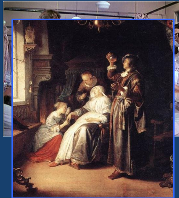
La Femme Hydropique Gerard Dou C.17th