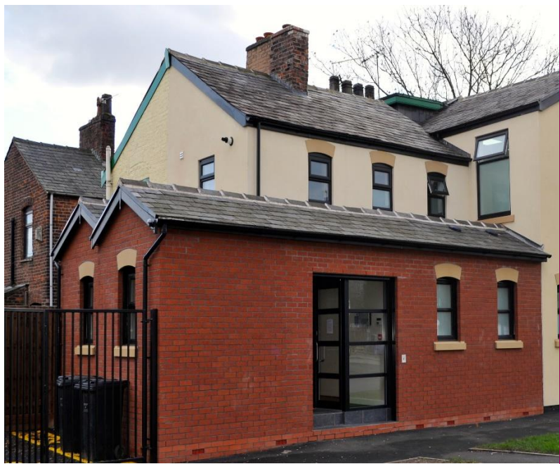
Foundation Dentist Surgery DFT (image)