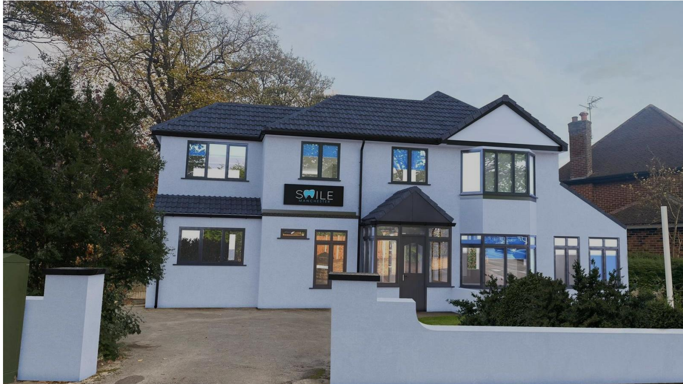
Foundation Dentist Surgery