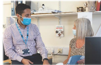
Guidance on settling into life and work in the North West of England

Welcome to the North West - A Handbook for International Medical Graduates